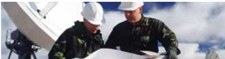
ITT's Systems Division is manned 70 to 80 percent with military experience.

Hiring military keeps the country operating. Our veterans are qualified technicians, leaders, managers, and achievers. Corporate America knows it, and our Top 50 Military-Friendly Employers® are securing their success in the future by hiring military today. For those transitioning from the military into the civilian workforce – here are 50 outstanding places to start your new career. ★