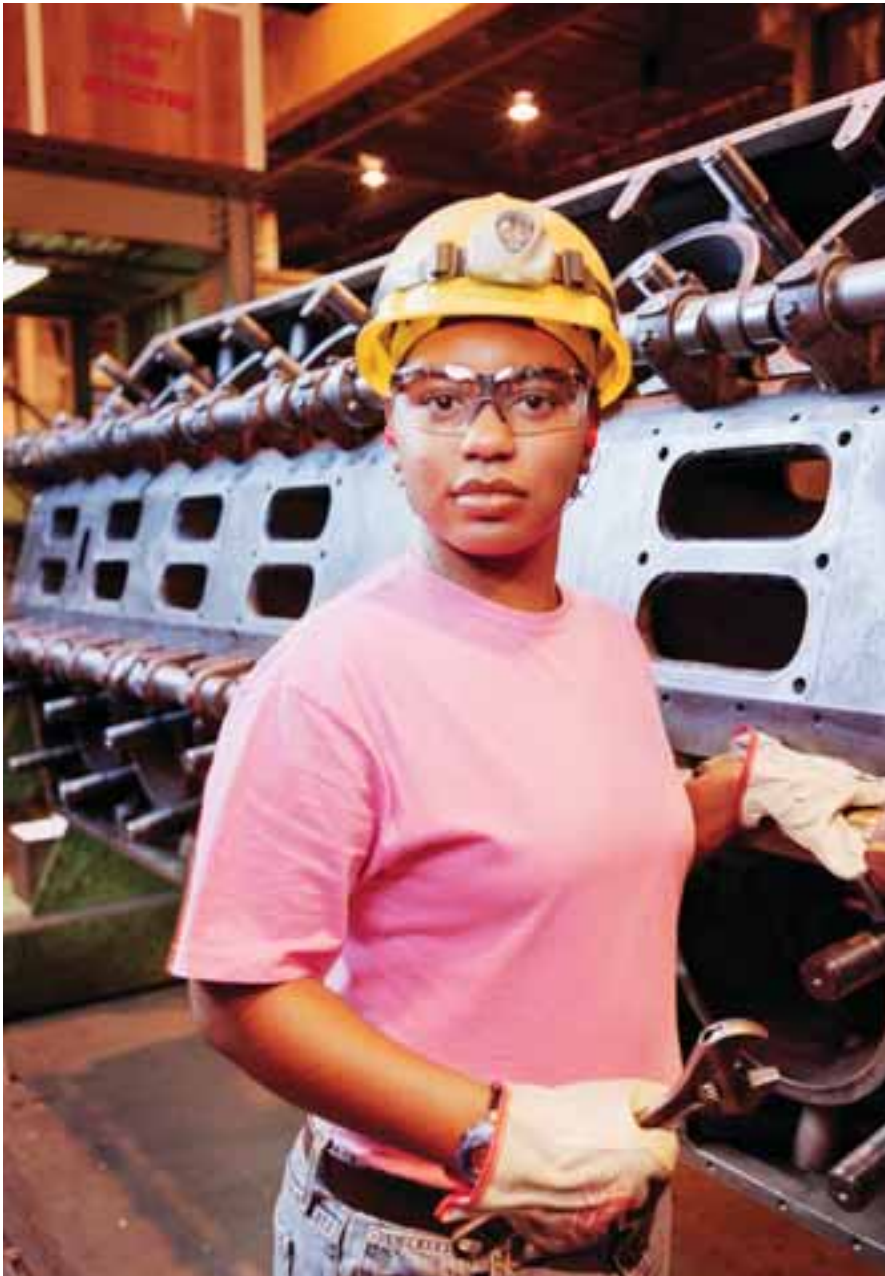
Union Pacific has consistently made G.I. Jobs' Top 50 Military-Friendly Employers® since 2004.

“While serving their country, military personnel also gain specific technical skills, education and work experience suitable for a career in the utility industry, thereby saving training time and costs for both the employee and the company.”