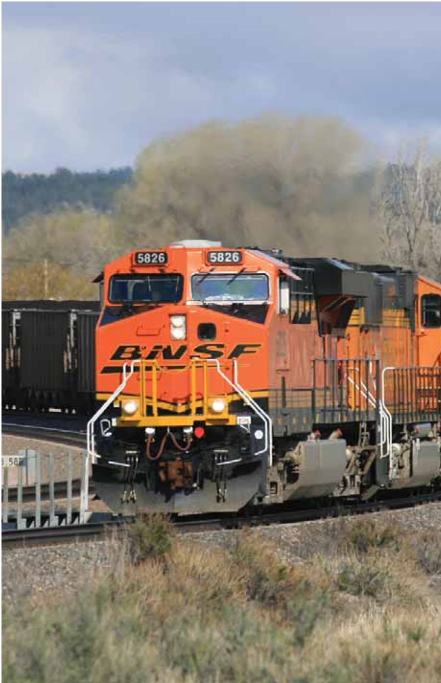
BNSF Railway ranked No. 1 in this year's Top 50 Military-Friendly Employers®.