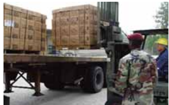
ITT scored high in its proactive relationships with Transition Assistance Programs.

ture to employers of an employee that will come to work with concrete skills, knowledge, confidence and commitment. Again and again, representatives from our Top 50 companies identified personal traits, just as often as they mentioned technical skills, as a reason to hire military. The military is a proving ground to employers where experience, maturity, and character are developed. There are few places in the world that offer the quality and depth like military training. For companies looking to hire, this is really a matter of dollars and cents.