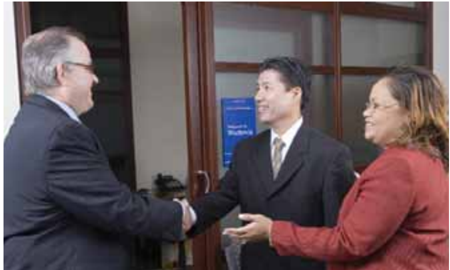
Wachovia Corporation worked hard to attract military personnel earning a spot in G.I. Jobs' Top 50.

BNSF, G.I. Jobs' No. 1 of the Top 50 Military-Friendly Employers® 2007, recognizes the talent associated with military service.