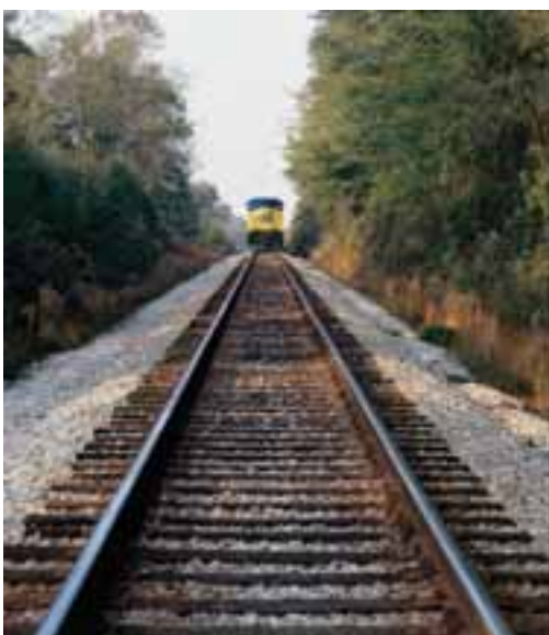
CSX views those with military experience a tremendous talent pool of quality employees.